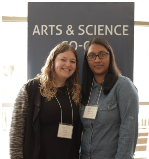
STUDENT PRIZES $100-$200

Support a student in their academic pursuits by sponsoring a student to present their research findings at the conference.