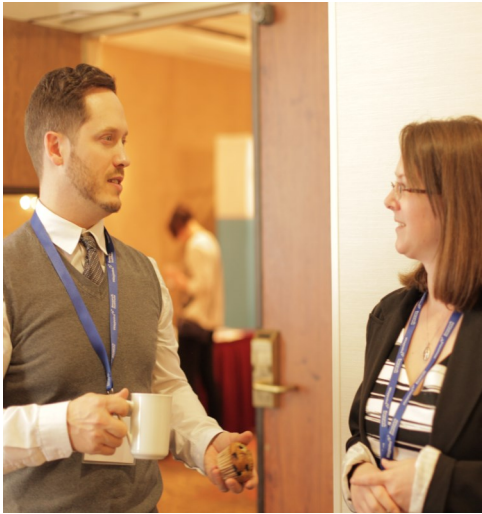
NETWORKING EVENT $1,500

An evening designed to encourage collaboration, as attendees dedicated to shaping the future of mental health treatment and care build new relationships.