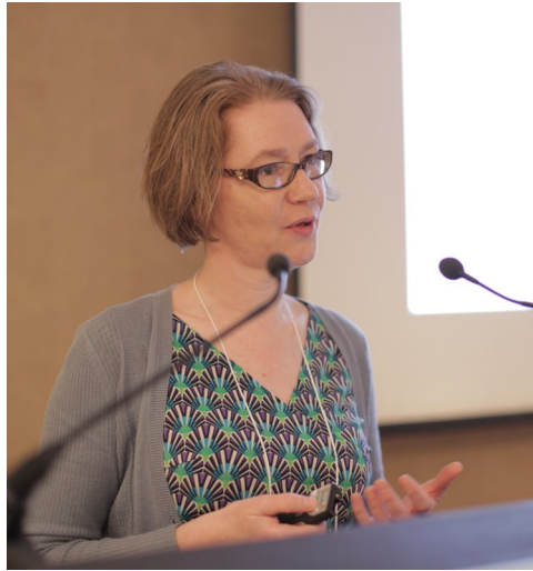
PLENARY SPEAKER SPONSOR $1,000

An evening designed to encourage collaboration, as attendees dedicated to shaping the future of mental health treatment and care build new relationships.