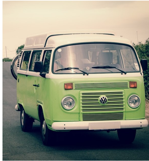
TRAVEL BURSARIES $150

Help us celebrate the success of student participants. 1st Prize—$200 2nd Prize—$150 3rd Prize—$100